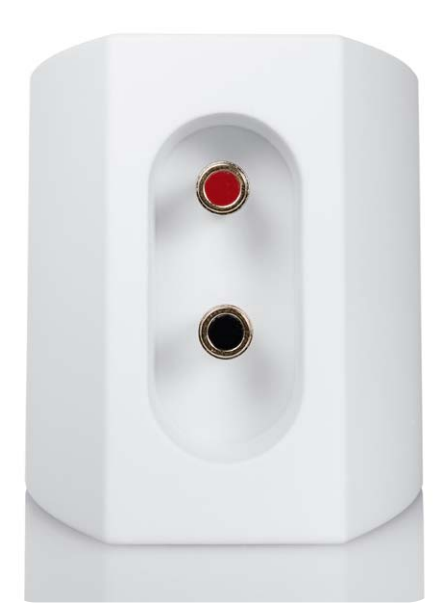
are they? cable connections? the? satellite? massive 'and' gold

gewinkel at. The subwoofer can be placed outside the direct field of view. Here one should be avoided if possible, to position it in a corner or directly on the wall. By the resulting reflections there the bass loses then heard of precision and tonal linearity.