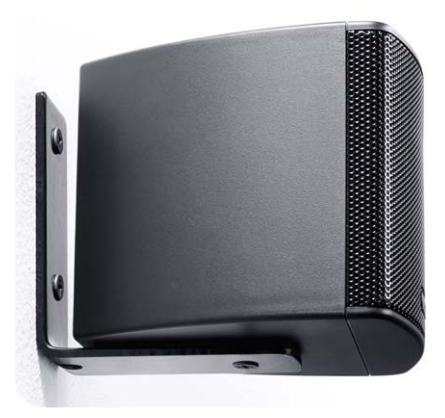
are? the? wall bracket? from? metal? the? delivery? included

The small satellite of the movie 95 sets fit easily with a height and width of each 9 centimeters into the living room one. Due to the small parking space requirements and the classy matt white boxes housing our test pattern you see the home theater components only at second glance. Thus, the compact boxes cubes can be operated virtually anywhere - on shelves, window sills, TV-boards or on the wall.